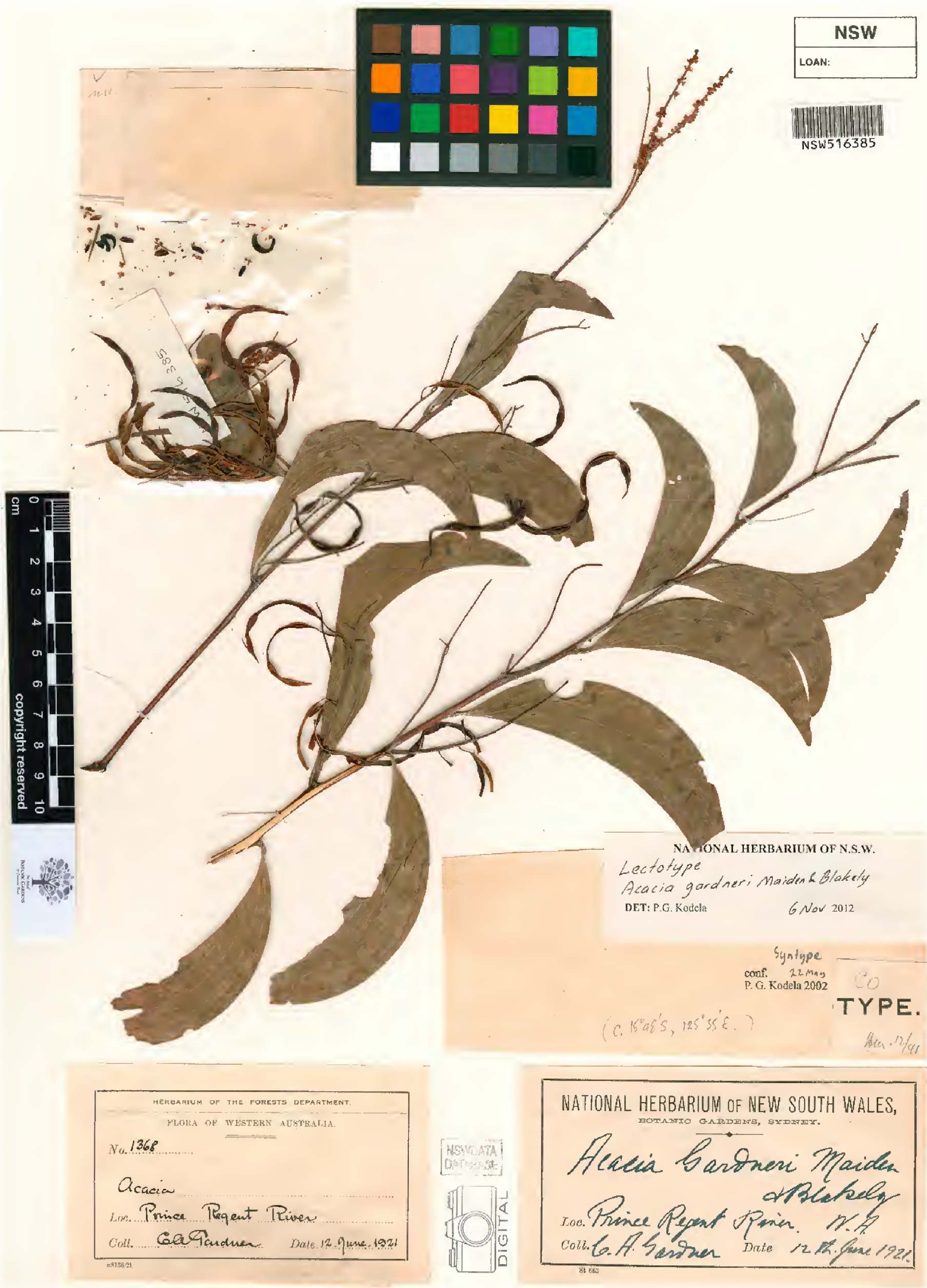
Fig. 1. Lectotype of Acacia gardneri Maiden & Blakely, NSW516385